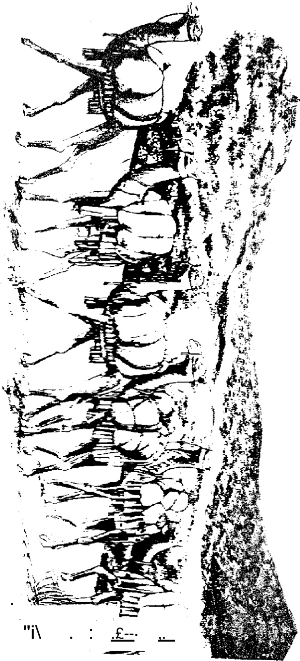
Illustration : Trading caravan