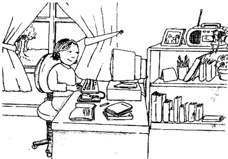
Illustration Girls should receive a good education